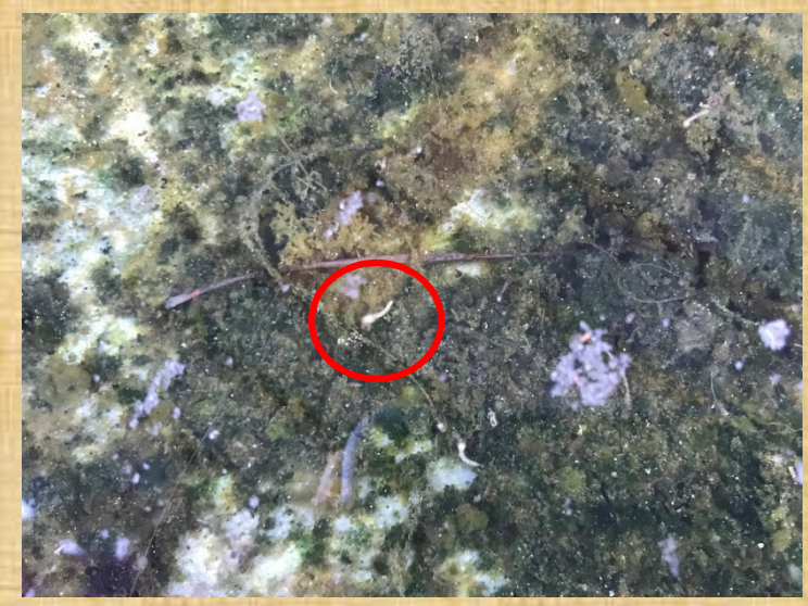
Bti/Bs product-dead larvae