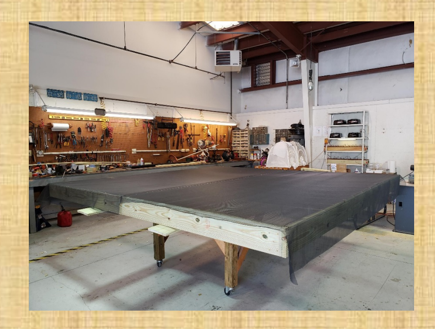
Top frame attached to bottom frame for stability while attaching screen and 2<sup>nd</sup> 1X2.