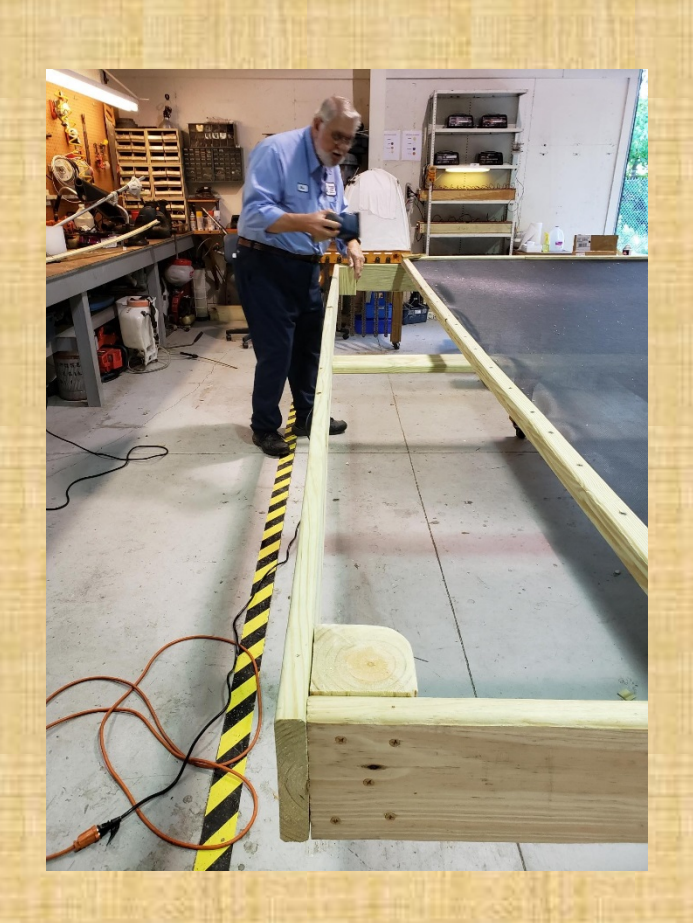
Screen top made with 1x2 plywood