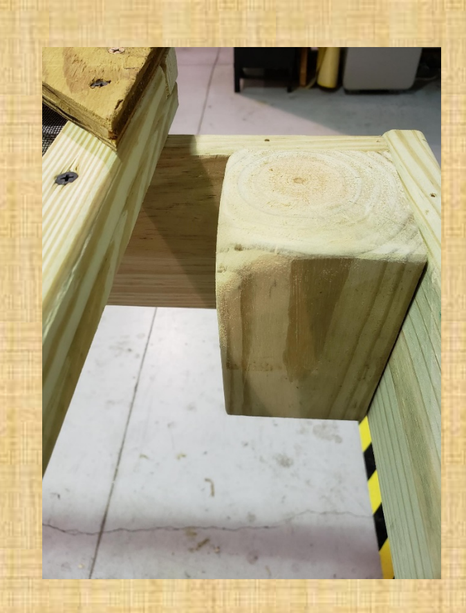
Smooth edge to protect liner