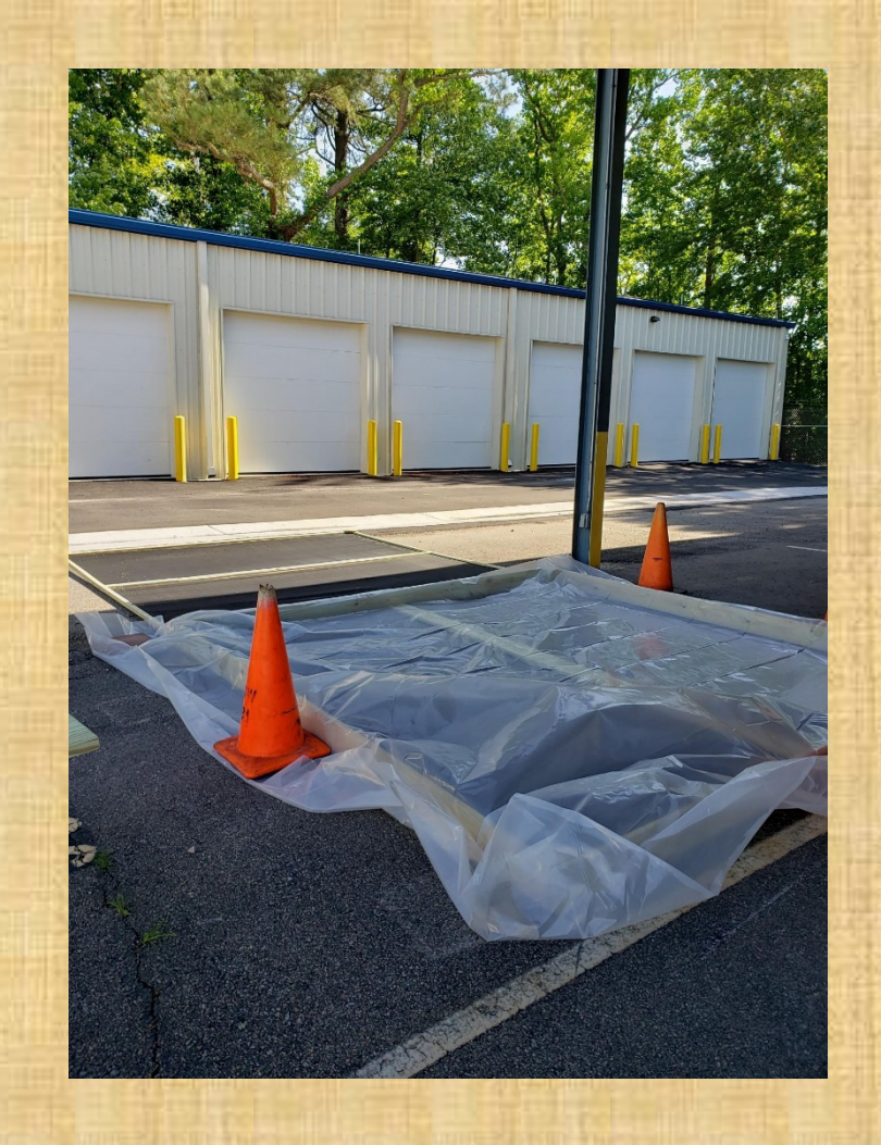
Plastic laid inside ready for water