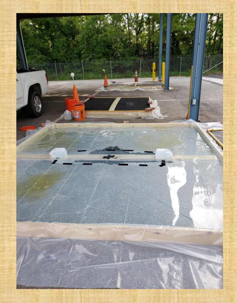
Then bucket of gravid water and wait at least 24hrs