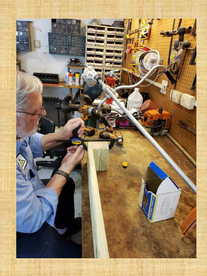
Attaching the corner 4x4 for support