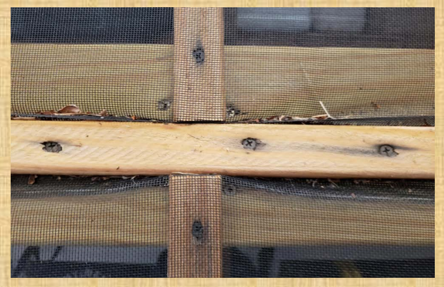
Center of top screen