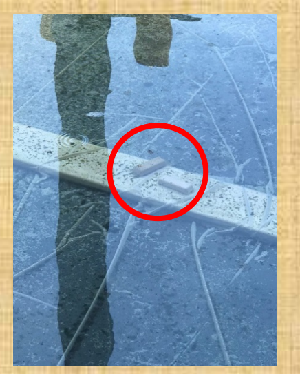
Blocks placed in the middle