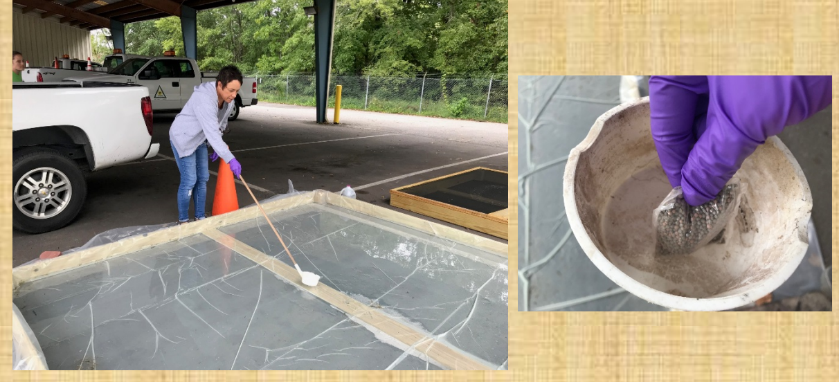
Always added in the middle