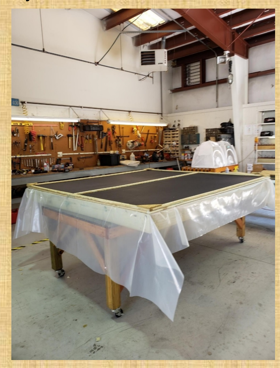
Plastic laid inside and cut to size