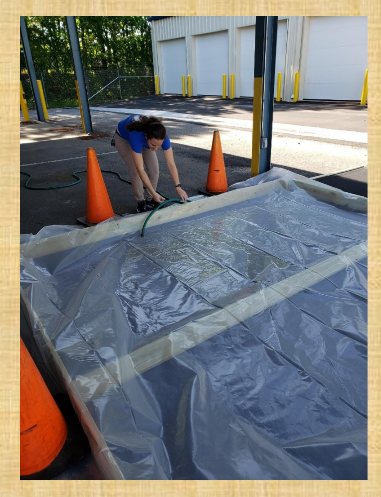
Tap water-deep enough to use dipper