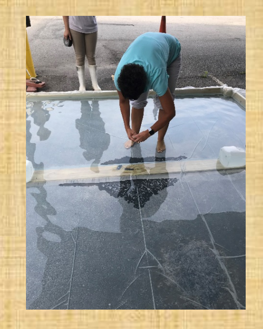
Duck tape underwater!