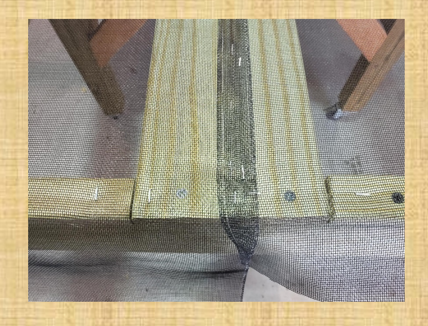
Stapled screen- 2 pcs- attached in the middle- 6ft each