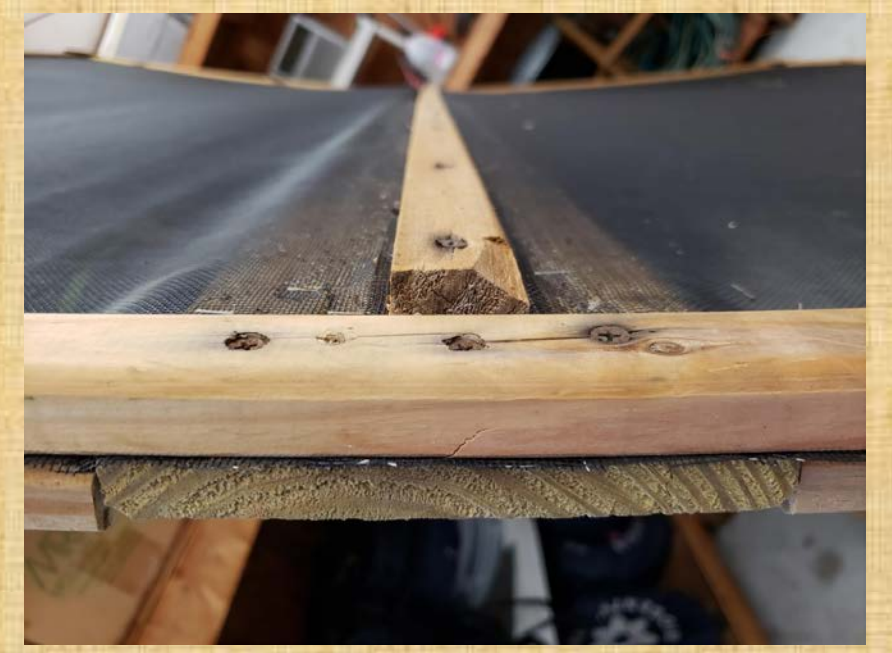
Top frame support beam (used 1x6- 10ft)

Screws were backed out one side at a time