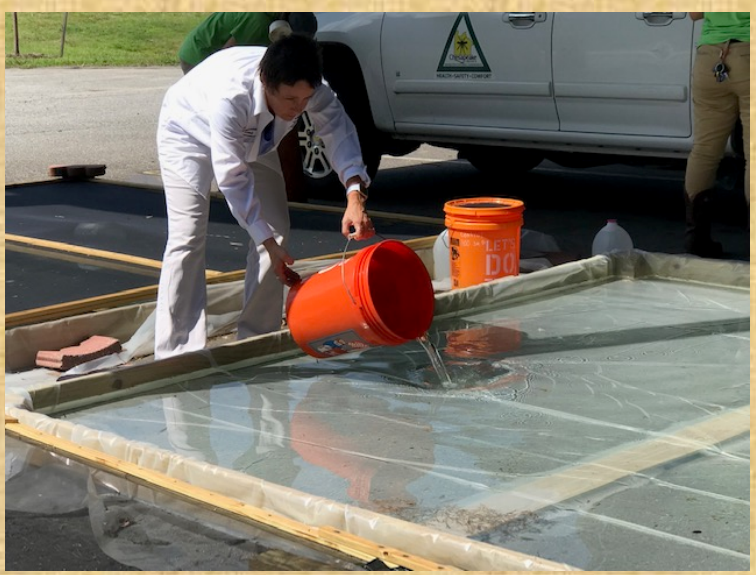
Larvae spread evenly around the pool