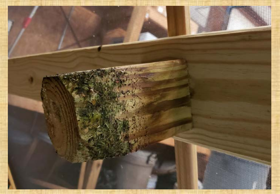
Support post attached to underside of top screen