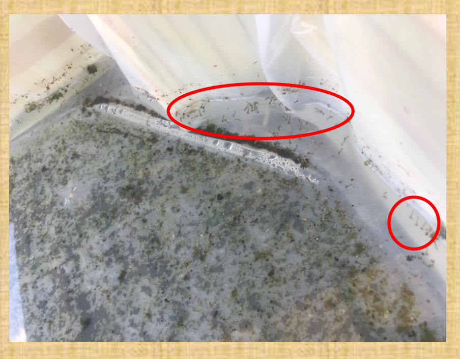
Methoprene product-larvae alive