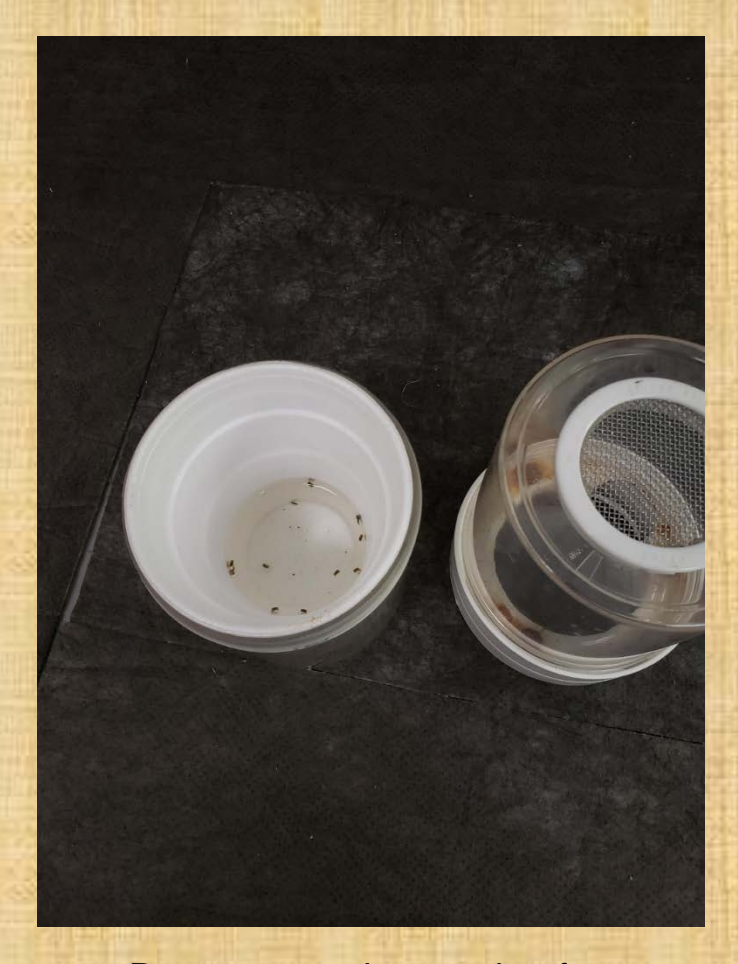
Pupa removed to monitor for death/emergence