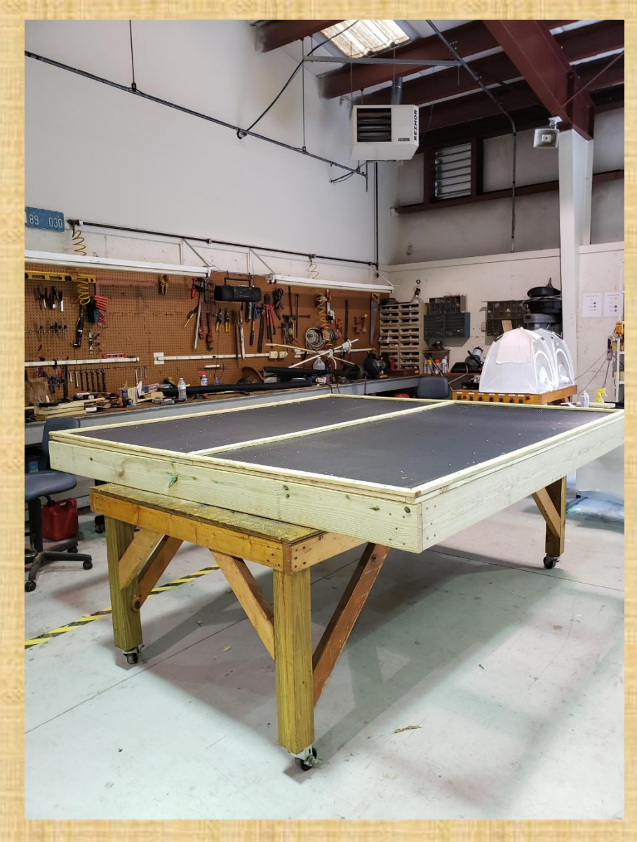
Completed 49sq ft top & bottom