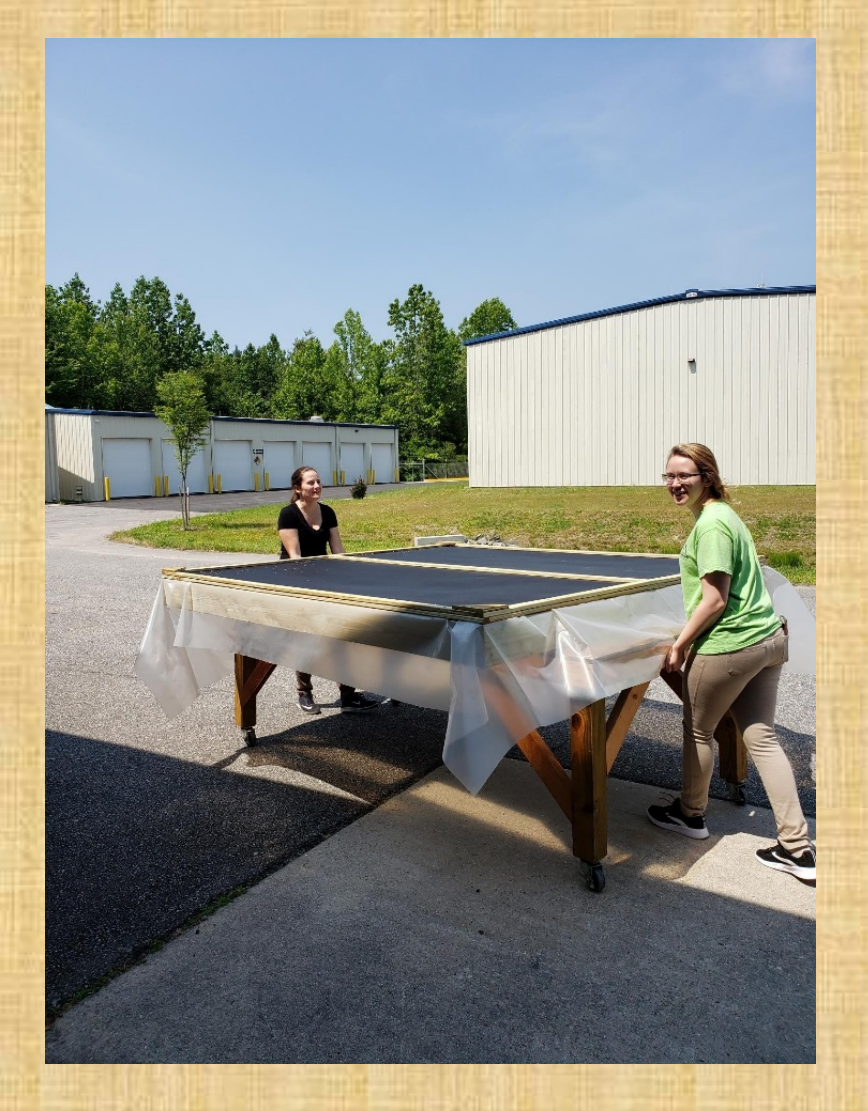
The 49ft easy to roll out!