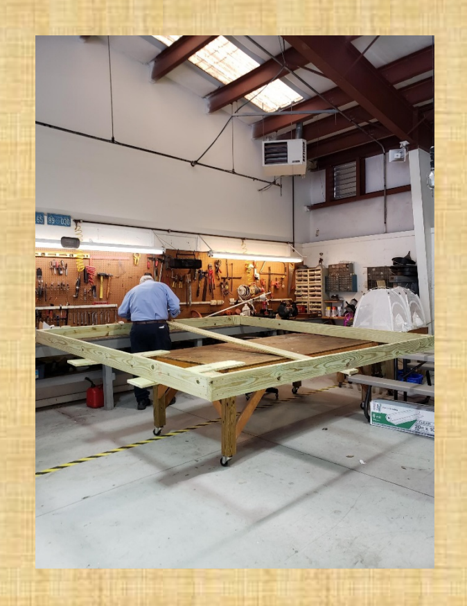
100ft bottom frameinserting middle 1X6 for support