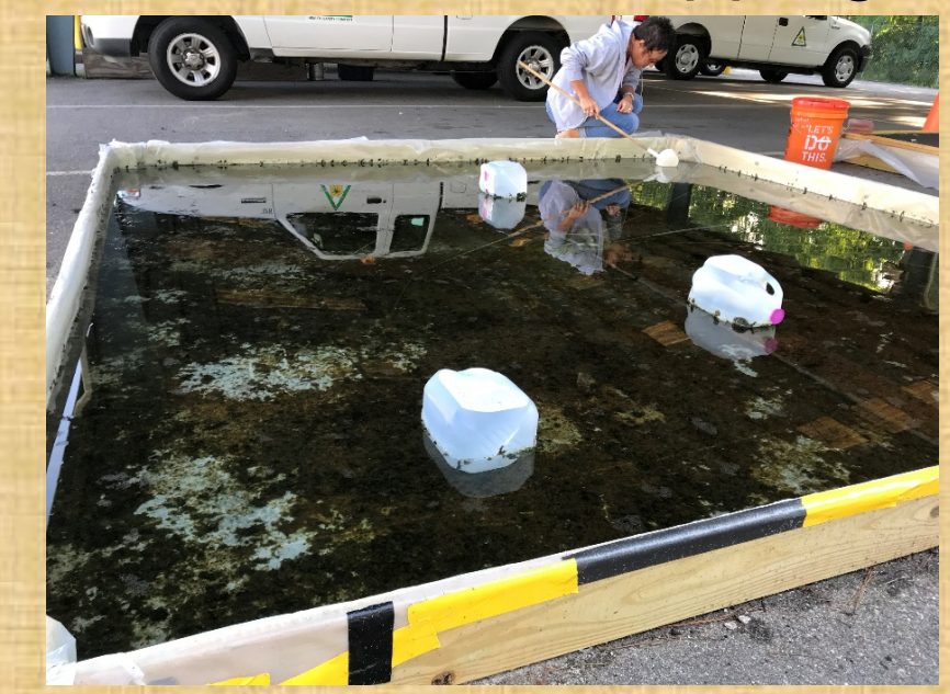
Dipping the pool