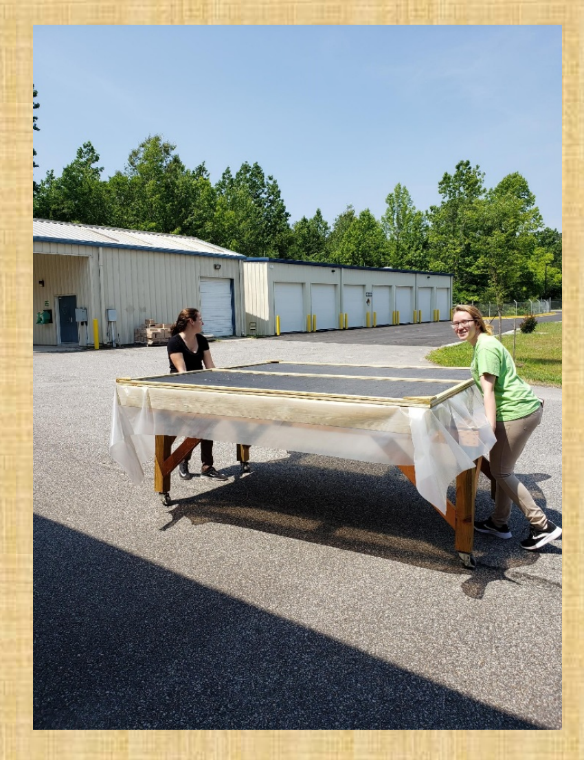
Rolling table worked great!