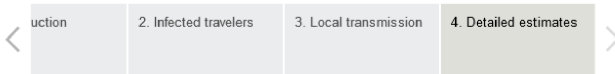
Location-specific estimates: average probability and uncertainty by month*