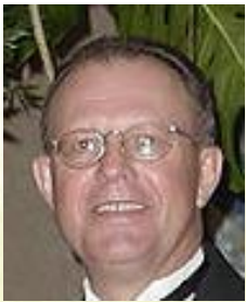
Larry Smith Industry